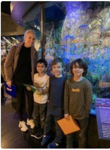
2nd Grade Field Trip to the Harvard Museum of Natural History